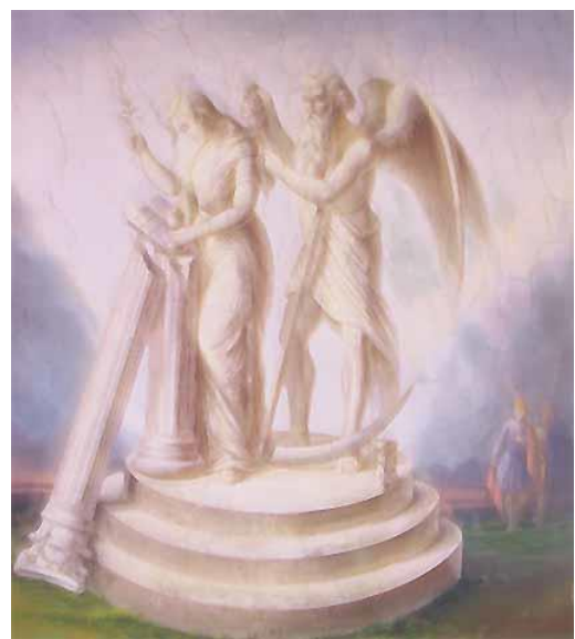
Time, Patience, and Perseverance

Freemasonry in Winchester, however, not only survived the War but by the end of 1864, had begun to thrive. The income derived from the aforementioned degree work amounted to $4,044.00, including $40.00 in Virginia banknotes and $60.00 in Confederate currency. By the end of 1865, the Brethren began discussing the possibility of constructing a building to permanently house the Lodge. Eventually, the Lodge purchased the Miller lot for $3,520.00 and erected the Masonic Temple in which it meets today.