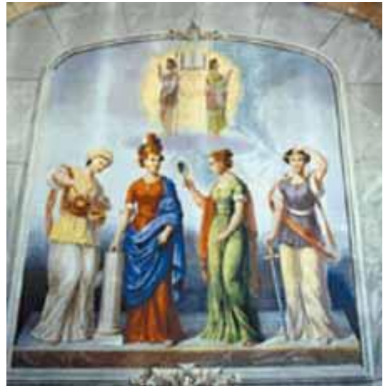
Four Cardinal Virtues

Unfortunately, the good times were short-lived. The February 1862 Stated Communication was canceled for want of a quorum, and on March 12, 1862, Union forces under the command of General N. P. Banks seized the town of Winchester. The citizenry was overtaken by a general panic and it was widely rumored that the Yankees would pillage the city and put it to the torch. These fears were not realized, however, and despite the natural tension which invariably exists between an occupation army and the